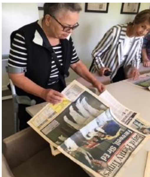
Reflecting on Sir Ed's life

Other groups have included Sir Edmund Hillary Retirement Village and Grace Joel retirement home.