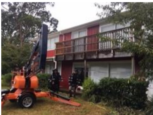
The TPS team at work